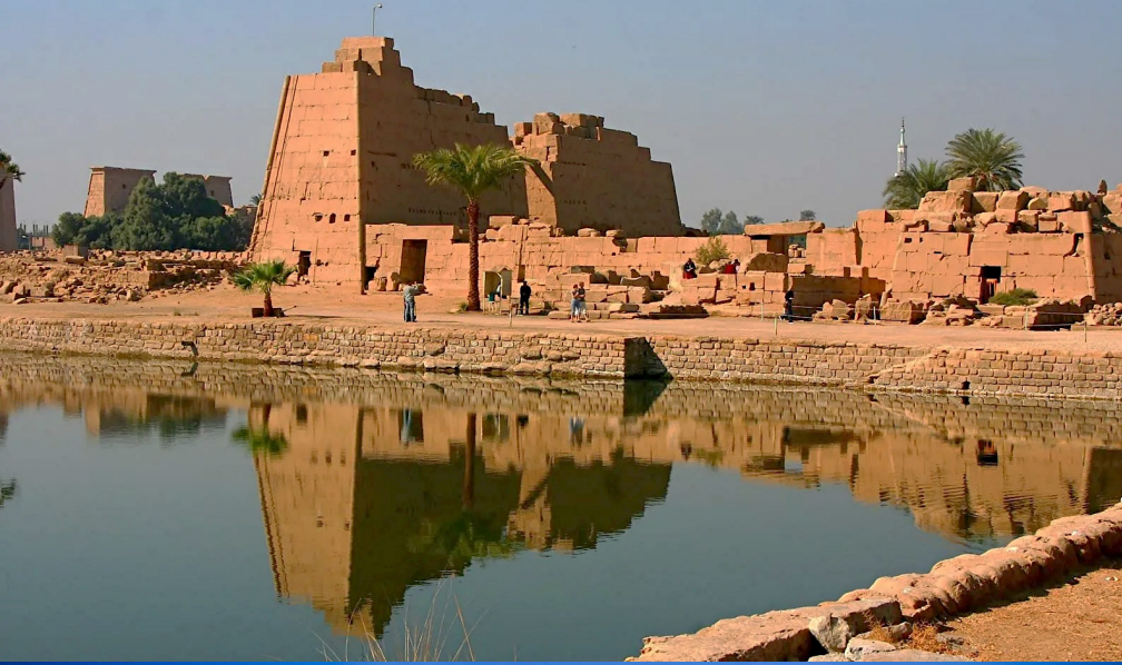
Karnak Temple in Luxor