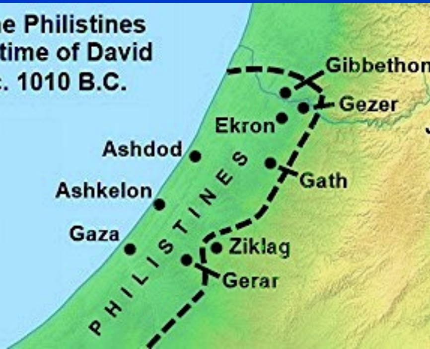
The Philistines at time of David c. 1010 B.C.