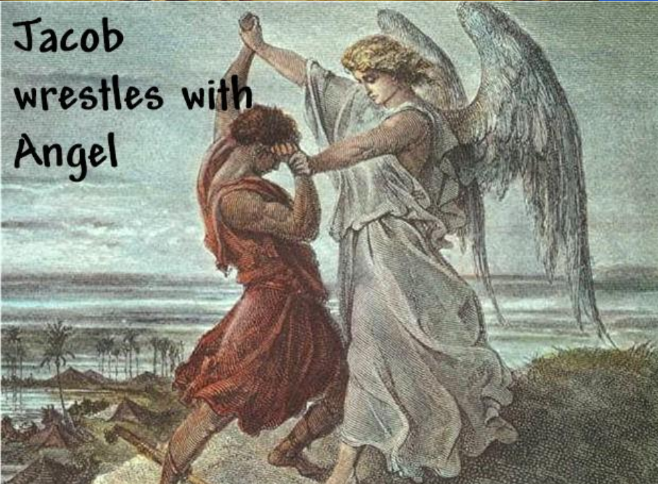
Jacob wrestles with Angel