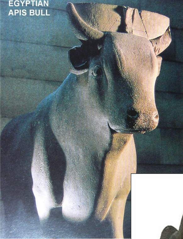
EGYPTIAN APIS BULL