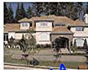
Become A Real Estate Millionaire!!