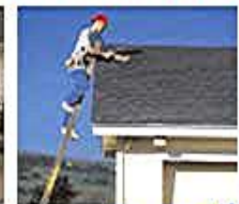
Fix Up A Home!!