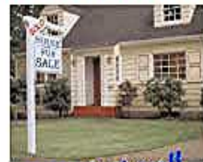
Buy A Home!!

Over 4,000 Government Grants And Low Interest Loans or You To Live In The Home You've Always Dreamed Of!