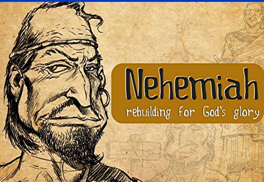
Nehemiah rebuilding for God's glory