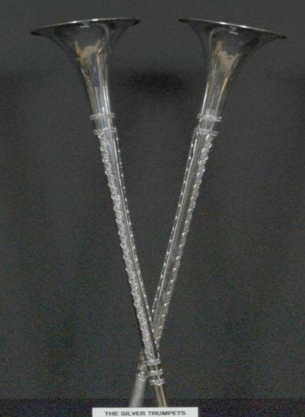
THE SILVER TRUMPETS