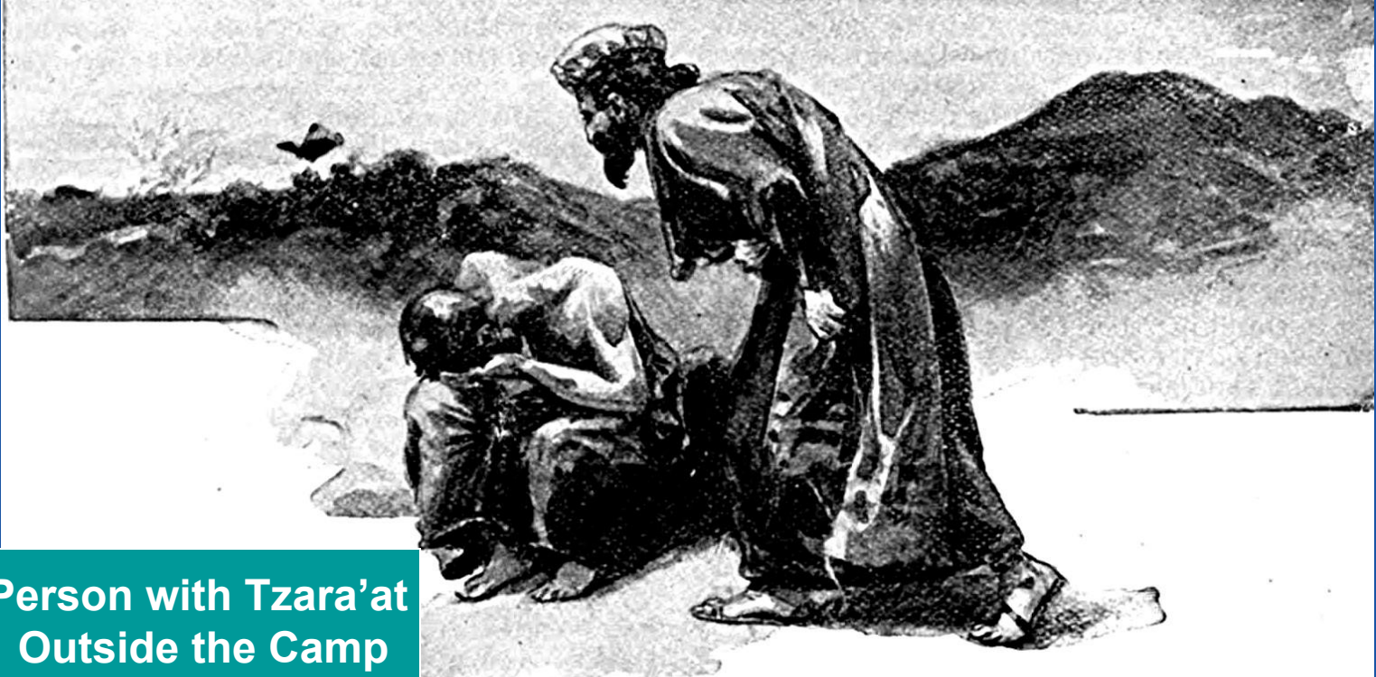
Person with Tzara'at Outside the Camp