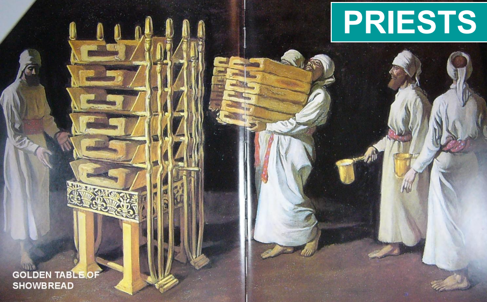
GOLDEN TABLE OF SHOWBREAD